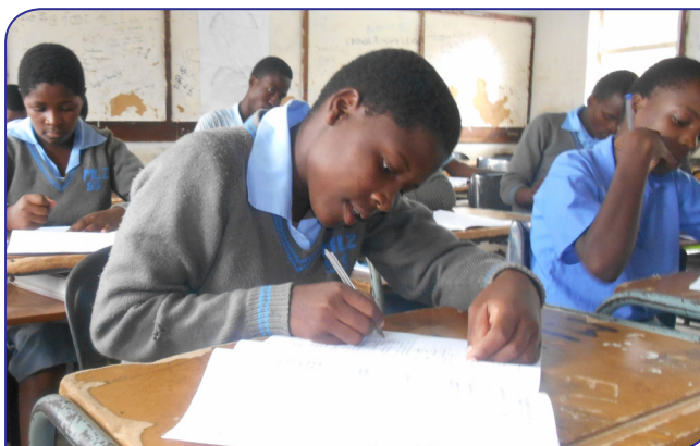
Candidates writing examination