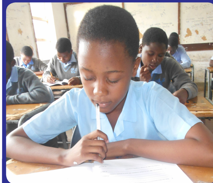
Examination in progress

Conducting valid and reliable examinations